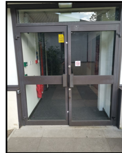
This is the door I will use to come into school.