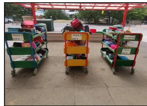
My packed lunch will stay on the trolley outside Year 2.