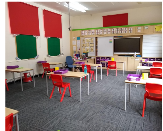
This will be my classroom.