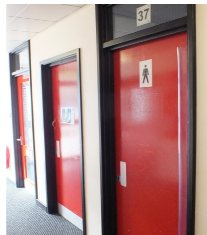
These are the toilets I will use.