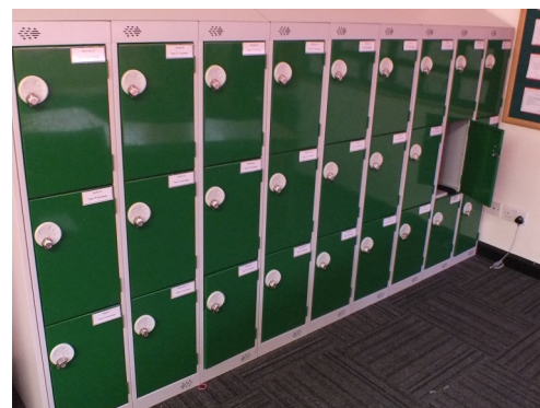
I will keep my PE kit and book bag in my locker.