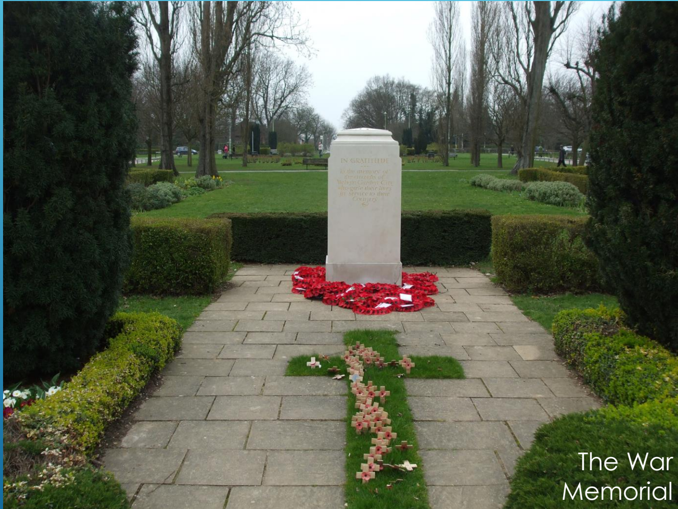
The War Memorial