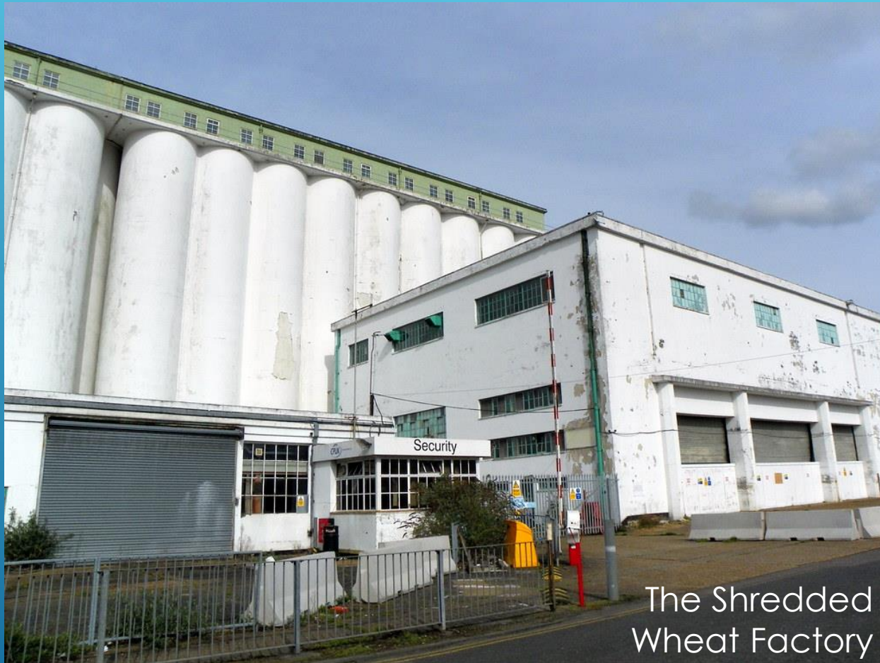
The Shredded Wheat Factory