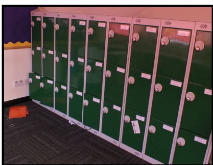
I will keep my belongings in my locker