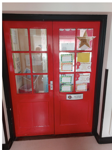
This will be my classroom door