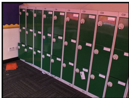
I will keep my belongings in my locker