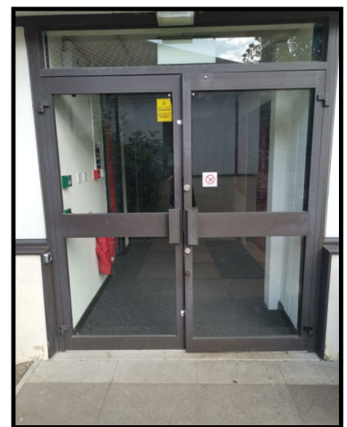
This is the entrance I will use