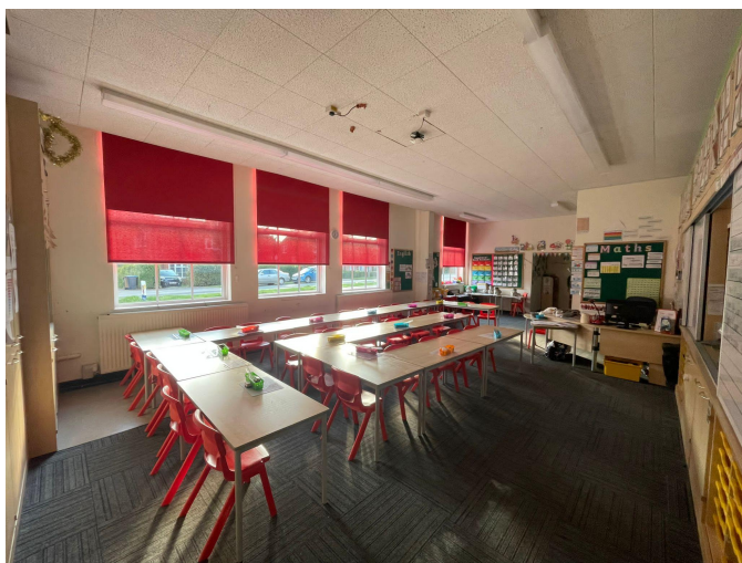
This will be my classroom