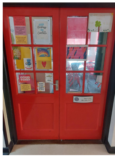
This will be my classroom door